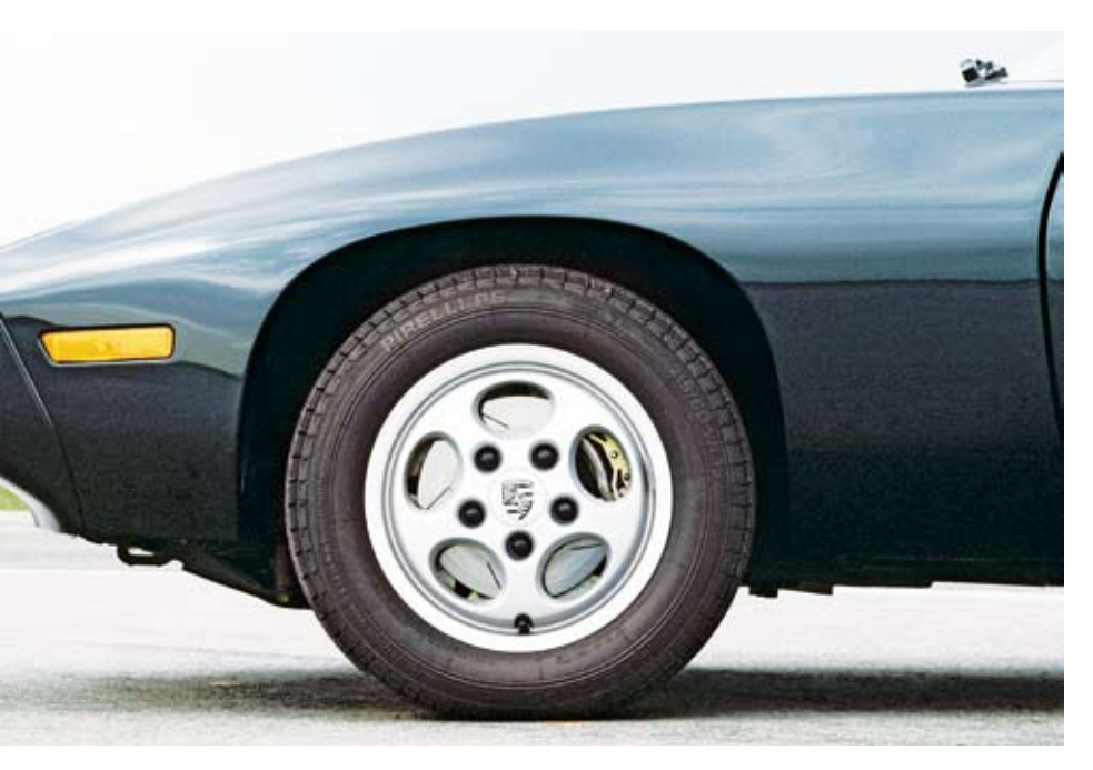
Close-up of the 15-inch alloys, fitted to a 1981 US-spec 928 model.