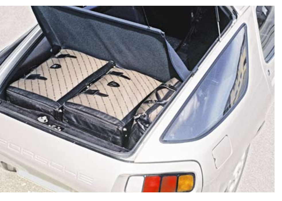
Porsche luggage in the trunk of the strict 1981 928. Note the revised luggage cover that had been introduced the previous year.