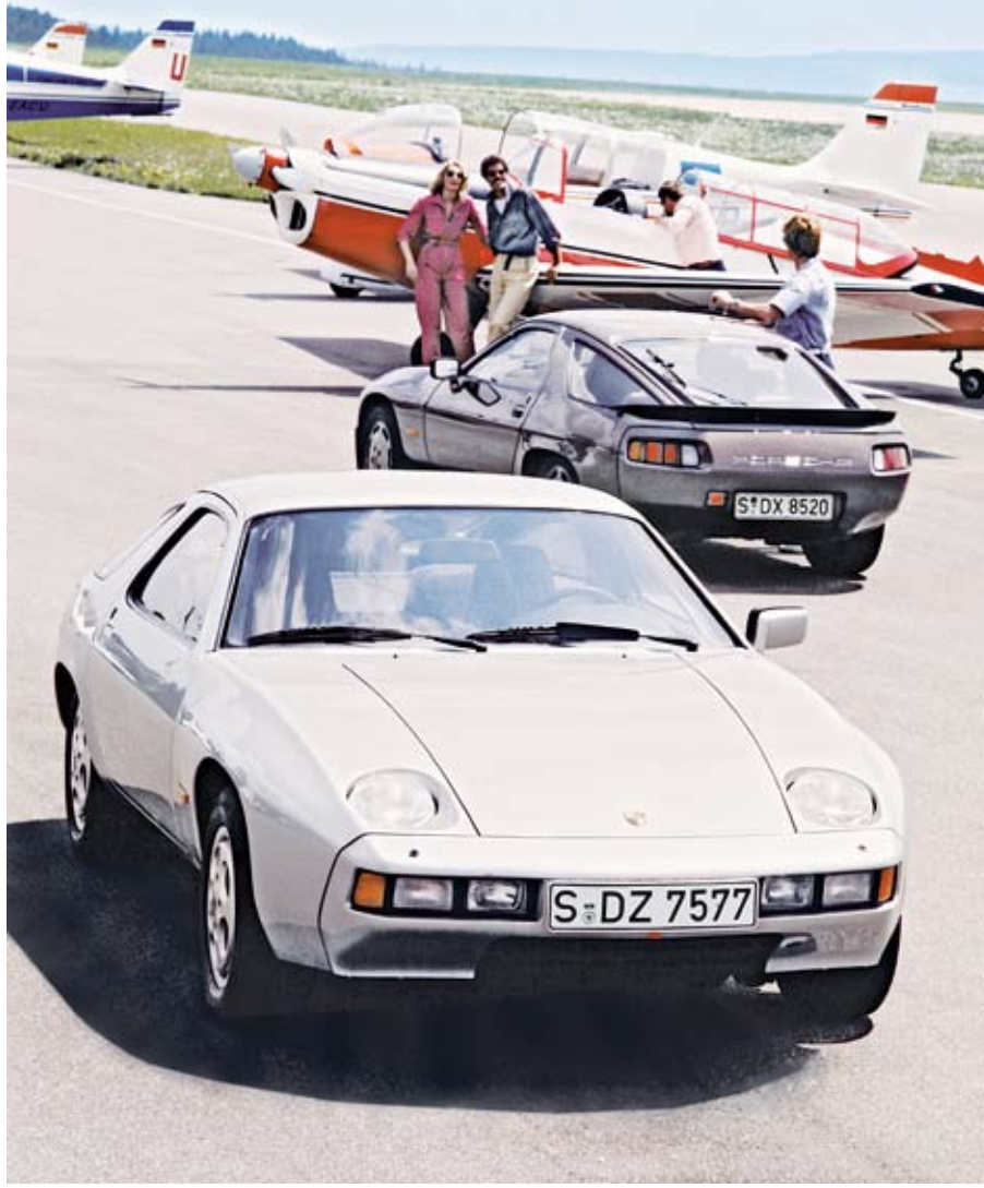
Another view of the domestic 928 (foreground) and 928S from 1981.