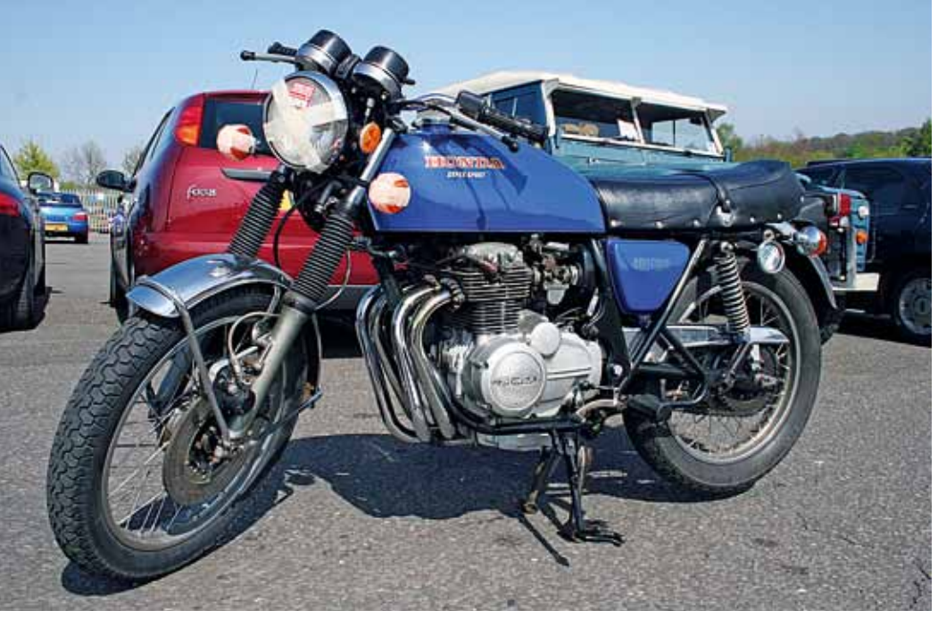
400/4 is a different – and sportier – prospect.