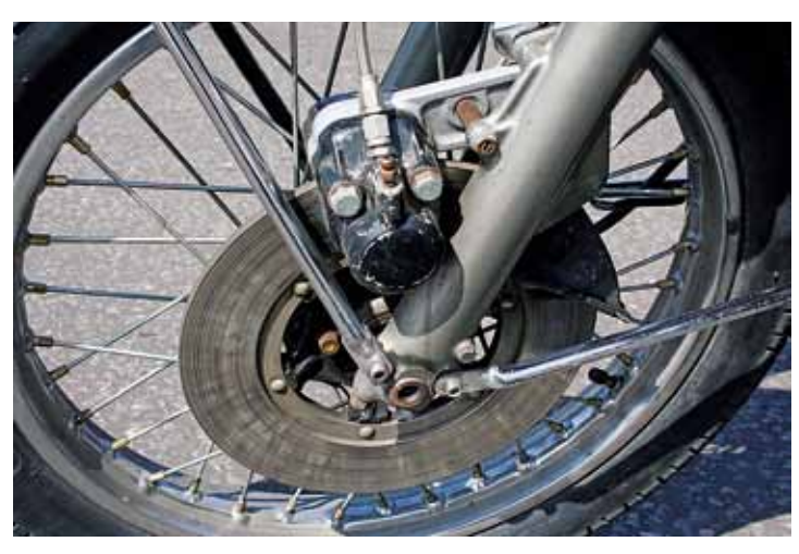
Partially seized brake caliper is a common fault.

Switch off the engine and put the bike back on its centre stand. Check for play in the forks, headstock and swingarm. Are there leaks from the front forks or rear shocks? Check the wheels for loose or broken spokes, and run a screwdriver liahtly over the spokes (which obviously doesn't apply to later bikes with Comstar wheels). listening for any that are 'off key'