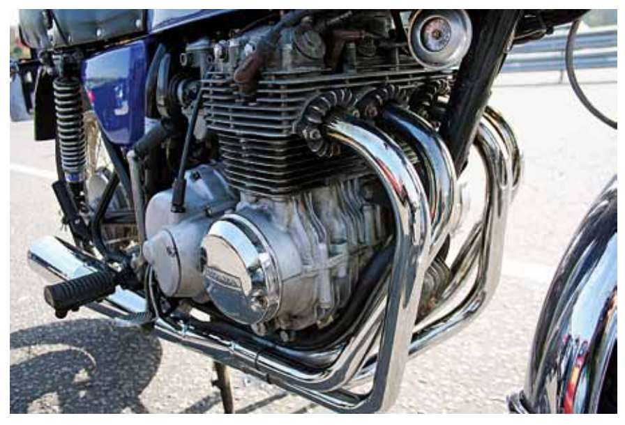
Even honest dirt can take some shifting.

Some people buy classic bikes because they love the restoration process: the strip down, the searching for rare parts and the careful rebuild. This page is not aimed at them. If you've never tackled a restoration before, it's a tempting prospect, to buy a cheap and tatty bike that 'just needs a few small jobs' to bring it up to scratch. But be honest with yourself - will you get as much pleasure from working on the bike as you will riding it? A good restoration takes time, and usually far longer than originally envisaged when those 'few small jobs' turn into big ones.