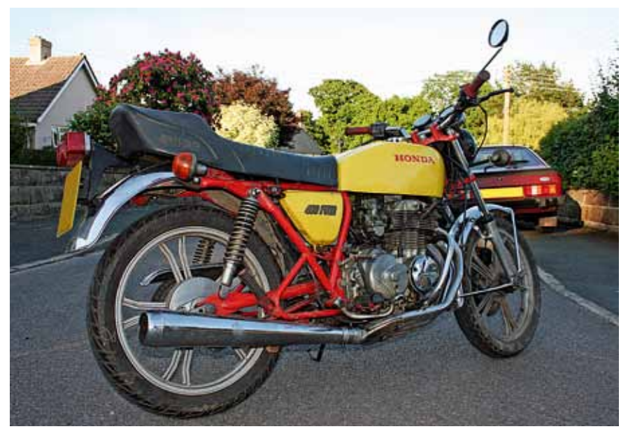
Even a non-standard four can make a fun classic bike.

Very good. All Honda fours are smooth and tractable on the road, with strong electrics and good reliability. Given regular maintenance, they can still be used as everyday bikes.