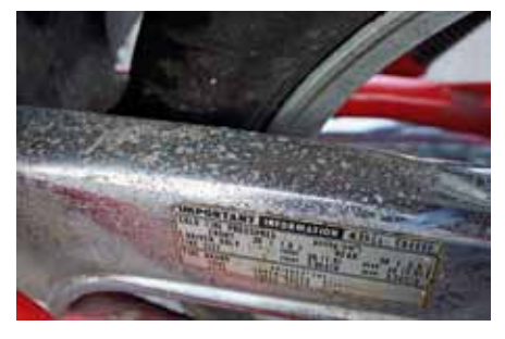
Chrome can be replated.

The alternative is to hand the whole lot over to a professional, and the biggest cost involved there is not the new parts, but the sheer labour involved. From a financial point of view. this simply doesn't make sense with a Honda four. A professional restoration doesn't come cheap, and there are so many of these bikes around that the restoration cost will never be recouped by a high end value. If you still want to go the professional route, make it