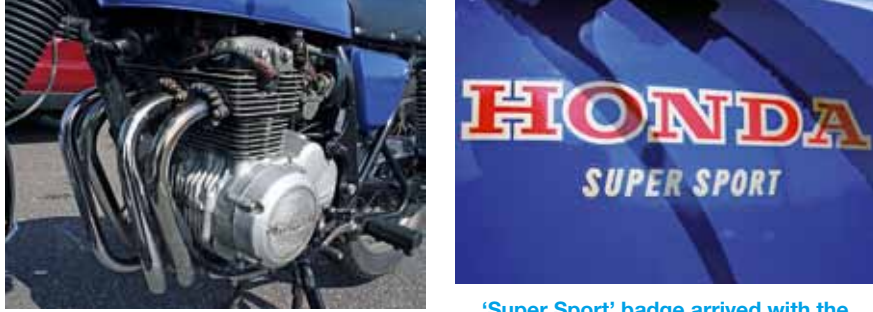
400cc four is a lively little motor.

Super Sport' badge arrived with the 400/4.