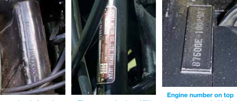
There may also be a VIN of crankcase behind

Hondas have long been known for their good finish, and the paintwork on the fours confirms it - there are plenty of bikes around in their original coat of paint, which still polishes up well. Look out for scratches and chips - these aren't enough to reject any bike, but if unsightly they are a lever to reduce the price.