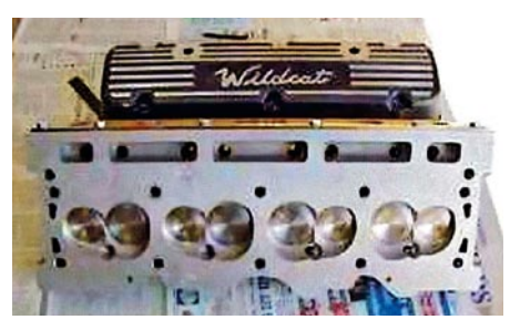
4-2-5 This is the ultimate Wildcat head. The valves, particularly the inlets, are noticeably bigger.

These heads are aluminium, and were originally fitted to the 1964 Buick 300ci engine. They are, therefore, of some age and, consequently, need to be purchased with care, but they are in many ways ideal, weighing only 18.5lb each (complete with valves, springs and retainers). They were fitted with better, although still restrictive, valves at 1.625 intake and 1.313in exhaust. Thus the standard/stock 300 heads will not flow sufficient mixture to keep up with the demands of the 4.6-litre, but would probably be acceptable for a 4.0-litre engine. They can, however, be fitted