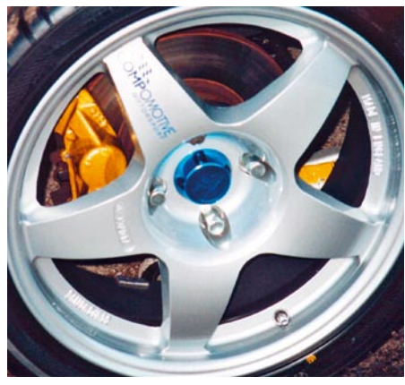
10-6 The brake caliper clearance offered by these superb Compomotive wheels is exemplary. The rims are 7in and are running 205 x 50 x 16in tyres, while also showing off the brake calipers (in this case SD1 Vitesse).