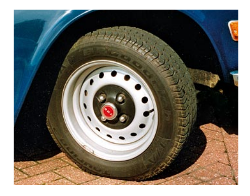
10-3 A TR6 wheel. This is an example of the later, wider 6J rim. The 195 x 65 x 15in tyre sits very comfortably.

huge variety of sizes, rim widths and patterns. Of these the evergreen Minilite (photograph 10-5) is probably the most popular and offers excellent capacity for brake size increases. There are a great many alternatives from numerous aftermarket sources too numerous to mention, but you'll get some idea of the range and options available from the pictures included in this chapter.