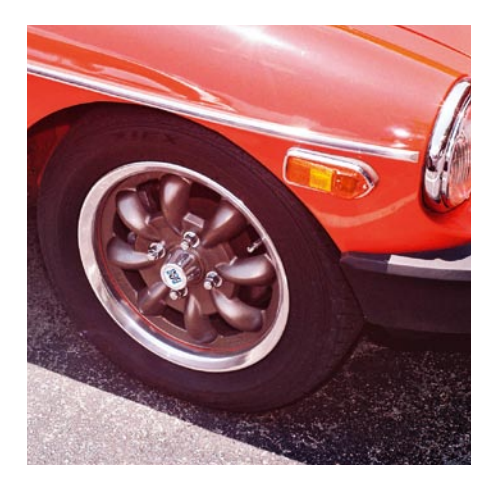
10-5 These are the more usual bolt-on Minilite wheels but this time finished in 'Slate.' The polished rims require some additional maintenance in that without care their surface will corrode.