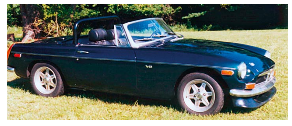
10-4 This is Kurt Schley's lovely 1974 MGB V8 Roadster – included here to demonstrate the aesthetic and practical suitability of Datsun 240Z 14in x 6J alloys.

You cannot just assume that your selected wheel size will automatically