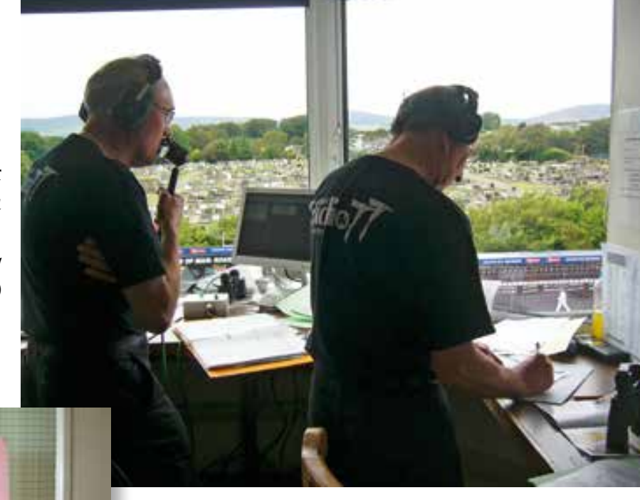
Enter at your peril!