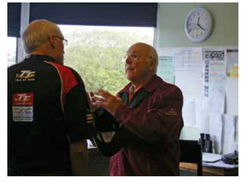
Finding out how it's done from Murray Walker.